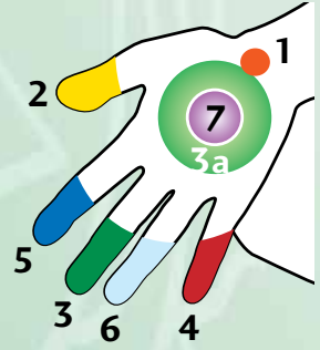
Subtle Body Signs on Hands